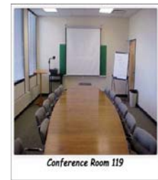
Conference Room 119

Hotels and Restaurants within minutes of the campus