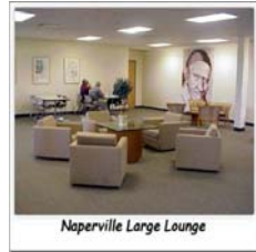
Naperville Large Lounge

http://suburbancampuses.depaul.edu/naperville